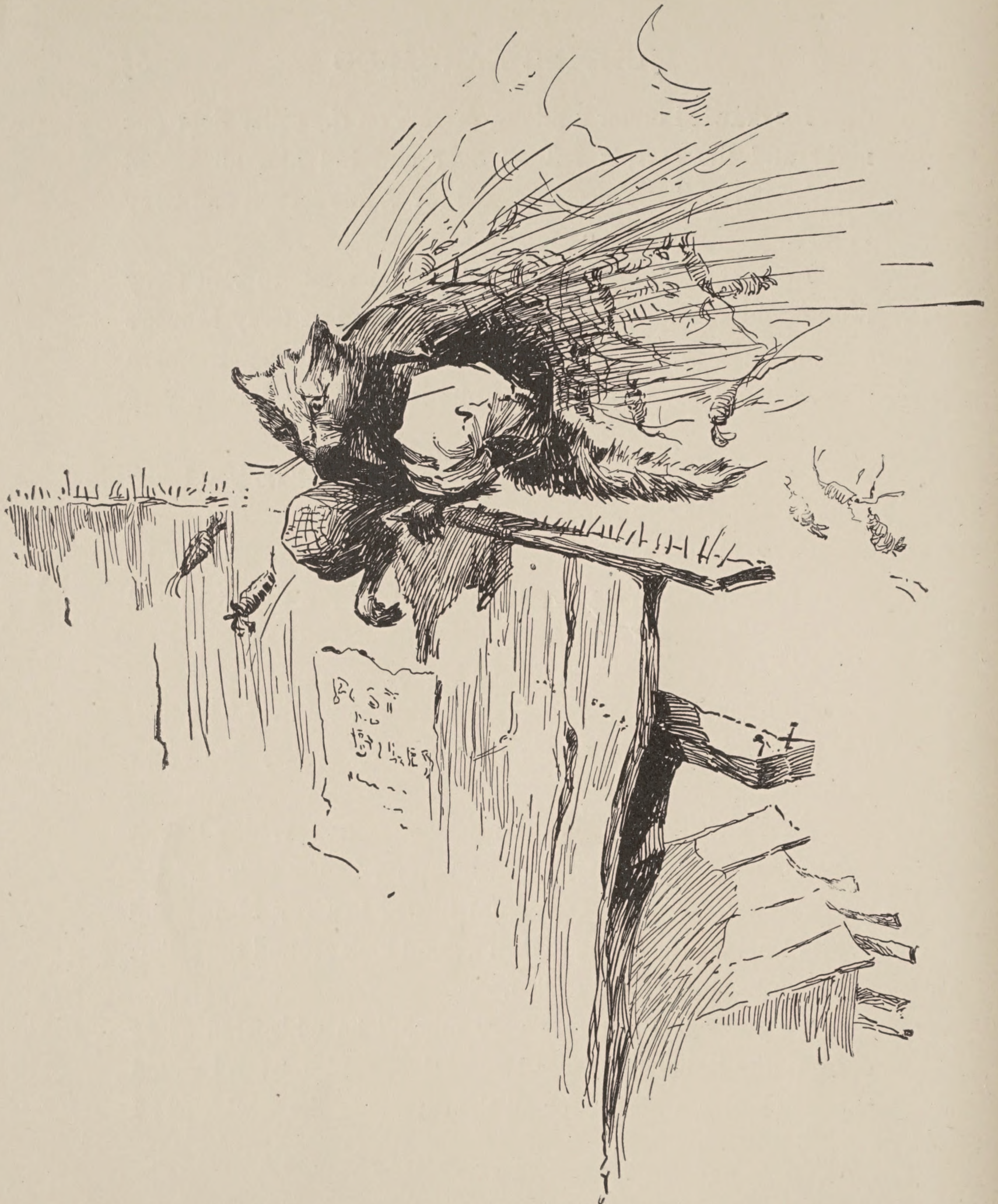
RETREAT OF THE APPLE BUTTER CAT.